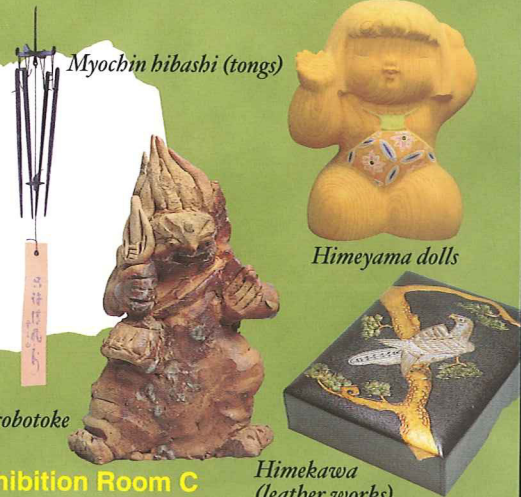
Myochin hibashi (tongs)