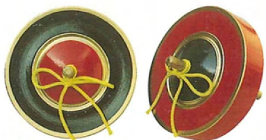
Himeji koma (tops)